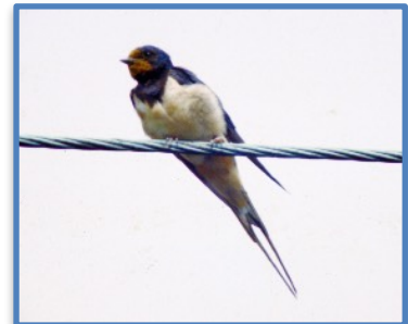
Swallow on cable in Court Avenue, Yatton in autumn 1985

3. Swallows generally used to nest in barns where they made a cup of mud and straw lined with feathers on a roof beam. They have adapted to making their nests on beams under bridges. Adult male Swallows have long tail streamers that are unmistakable, while the female's tail is shorter. Both sexes have a red throat. They are mainly black above and a creamy buff underneath.