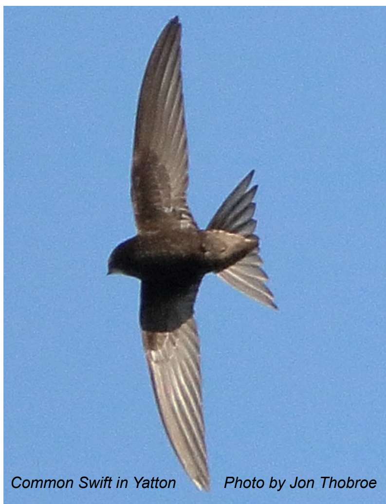
Common Swift in Yatton

PLEASE SEND YOUR PHOTOS, ARTICLES AND INFORMATION for the next newsletter to contact@yacwag.org.uk