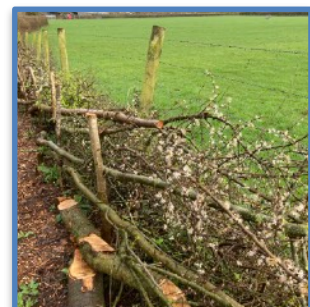
Blossom began to appear on the newly laid hedge