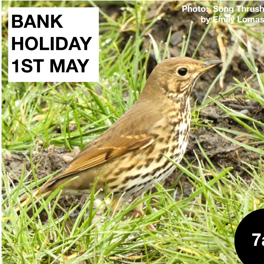
Photo: Song Thrush