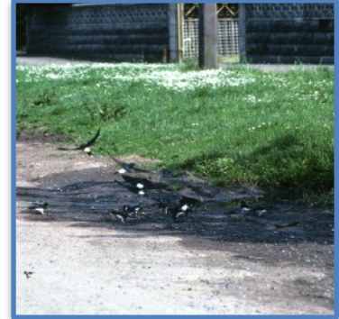
House Martins collecting mud for their nests in Chescombe Road, Yatton in 1986.

1. House Martins were once a regular and very visible summer visitor. Their populations are stable in other parts of Europe but in the UK numbers have long been declining and they are on the Red List for birds giving most conservation concern. One of the main reasons is the lack of their insect food, which applies to all similar birds. House Martins have a conspicuous white rump and a shorter tail than a swallow. Adult House Martins have pure white underparts too. The nests they build are amazing structures made of mud. For more information visit housemartinconservation.com .