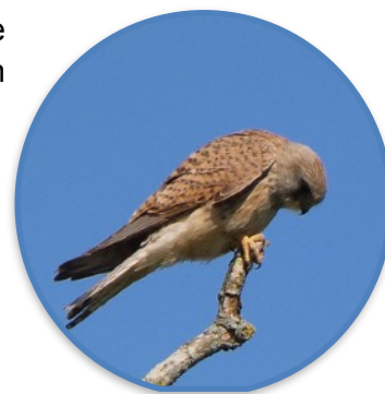
Kestrel on Congresbury Moor

Following the piece in the last news letter I have to report that our late summer inspection of the boxes revealed three dead Kestrel chicks in the Meakers box on Congresbury Moor. We are reasonably certain that at least one youngster fledged, perhaps two as I think that two deaths occurred before the summer inspection. We didn't see the corpses then as the three live chicks were blocking the view and we try to create as little disturbance as possible when checking the boxes.