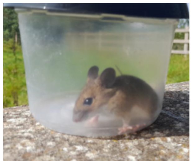
A Cobthorn Wood Mouse

In 2023, numbers have increased in the original Cobthorn Reserve, and as at October 2023 we have discovered 11 adult mice to date. Wood Mice make more use of the tubes both as shelter and as places to cache food supplies as the weather gets colder in the winter months. Hence, we would expect this number to increase further following the November survey.