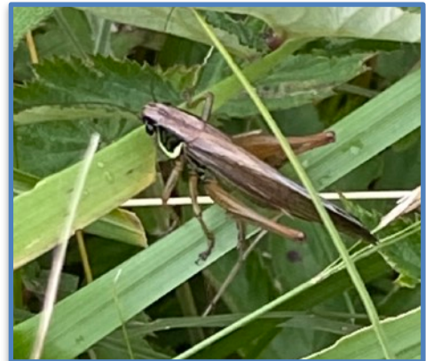
Roesel's Bush Cricket

It was fascinating stuff and required either excellent eyesight or a good magnifying glass. It was very satisfying to learn to tell the difference between grasshoppers and crickets. Crickets can often be heard before they are seen. This was the case for the Dark Bush Cricket for us. Several could be heard ... but none could be found. We had more luck with some of the other species and were pleased to find examples of Speckled Bush Cricket, Long-winged Conehead and Roesel's Bush Cricket (Macropeterous and its long-winged variant).