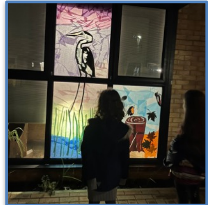
2023 Window Wanderland

We would love to hear from anyone who would like to help us prepare for this community-wide indoor/outdoor event. There is a lot to do and not much time to do it! Email yacwag2@gmail.com .