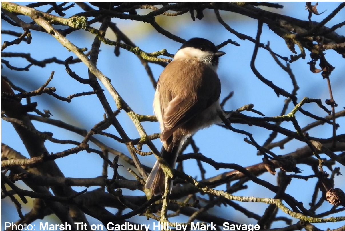
Marsh Tit on Cadbury Hill