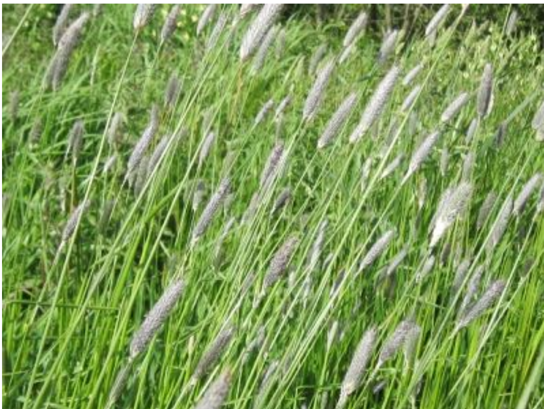
Look out for meadow foxtail, often the earliest grass to flower

Hoping you can get to some of YACWAG's spring events. Please put them in your diary!