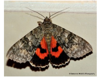
Large Red Underwing