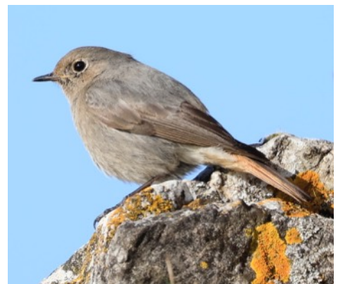
Black Redstart photo by Emily Lomas: Brean Down in March

This note draws on information published in British Birds journal, March 2026.